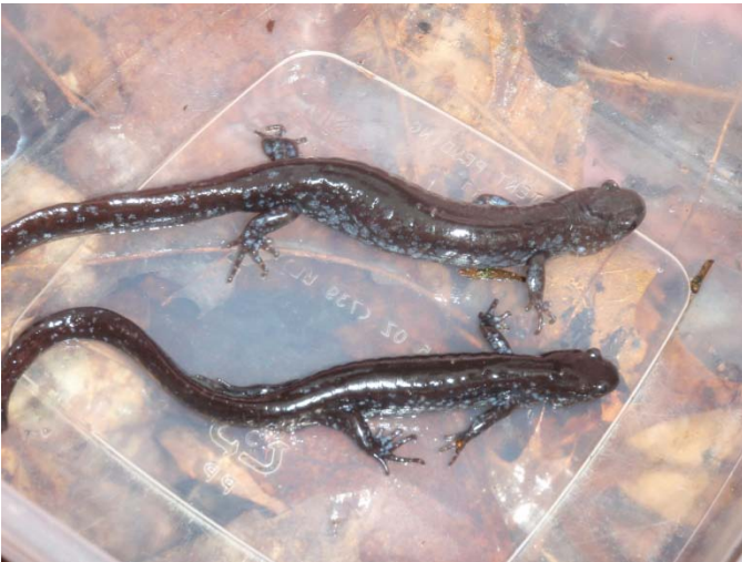
Unisexual Ambystoma (top) and Blue-spotted Salamander (bottom).

The unisexual Ambystoma are very similar in appearance to Blue-spotted Salamander and Jefferson Salamander, forming a continuum from the black base color, prominent blue spots/blotches, and narrow snout of Blue-spotted Salamander, to the grayish-brown coloration, diffuse blue flecks, and wide snout of Jefferson Salamander. Blue-spotted Salamander can often (but not always) be distinguished from unisexual Ambystoma in the field by size and coloration; adult unisexuals tend to have a gray to gray-brown base color (instead of black) and are noticeably larger (typically \geq 70 mm snout-vent-length, \geq 7 g) than Blue-spotted Salamander (typically \leq 60 mm, \leq 6 g).