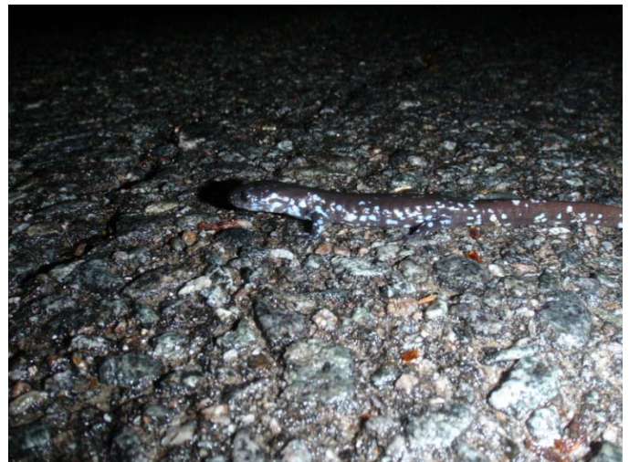
Blue-spotted Salamanders are not readily visible to motorists when crossing roads.

Active management of Blue-spotted Salamanders and their habitats is a developing interest. For example, construction of vernal pools to enhance breeding opportunities at sites where wetland habitats are scarce is a continuing line of research. Citizens play an active role in conservation by helping adult salamanders cross roads safely during their breeding migrations, thereby increasing survivorship and reproductive output.