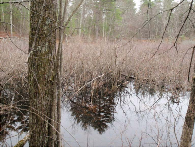
A typical buttonbush shrub swamp used by Blue-spotted Salamander.

vegetation providing refuge from fish) are additional characteristics of typical breeding sites.