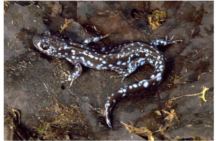
Blue-spotted Salamander

Larvae have bushy, external gills and a broad caudal fin that extends well onto the back. Young larvae are not easily distinguished from those of other Ambystoma species. Older larvae can still be difficult to identify, but they are generally characterized as brownish with a yellowish lateral stripe, whitish/unpigmented undersides, and a heavily dark-mottled caudal fin.